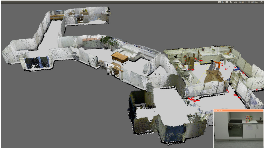
Fig. 1. User interface in zoomed-out perspective with apartment-sized environment mapped using voxel-based mapping technique

(“footprint”, yellow, Fig. 2), (8) a sectioned band of collision indicators around the robot lighting up when the robot slows down on approaching an obstacle or movement in a direction is not possible (not shown in Figs. 1 and 2). As a ninth element, a video image is overlaid. Users can freely rotate, pan, and zoom the 3D scene using the mouse. Navigation of the mobile platform is realized with the SpaceNavigator 3D mouse [14] in the coordinate system of the operator’s current viewpoint on the scene.